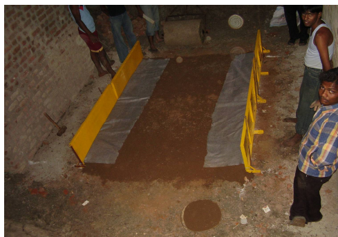
Plate 1. Wrapping with geotextile layer over the compacted fill within the lift thickness

MSE wall with marginal backfill soil without cement modification were constructed for load testing both at optimum moisture content and in fully wet condition respectively. Two more walls were constructed again using marginal soil as backfills after admixing with 3% cement content. In case the wall constructed using sand as backfill, no cement modification was adopted, as it is a non plastic, free draining and frictional material, for which the load testing was carried out only at optimum moisture content.