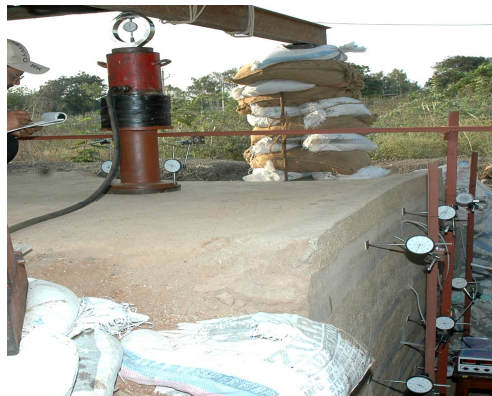
Plate 2. Observations during cyclic loading and built-in soil cement facing deformation of constructed model MSE wall.

Load was applied centrally over the top surface of model MSE walls through a 300 mm diameter and 38 mm thick steel plate with the help of a hydraulic jack. A proving ring of 20 ton capacity reacting against the knetledge loading frame (Plate 2) was used to measure the load and two dial gauges of least count of 0.01 mm were set on the steel plate to measure the settlements during load testing.